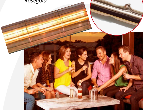
Standard low glare