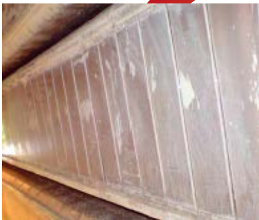
BEFORE installation of Victory IR system

With short-wave radiation, 90% of heat output is radiant and only 10% convection making it very energy efficient. The efficiency of Victory paper drying systems has been proven in installations throughout the world.