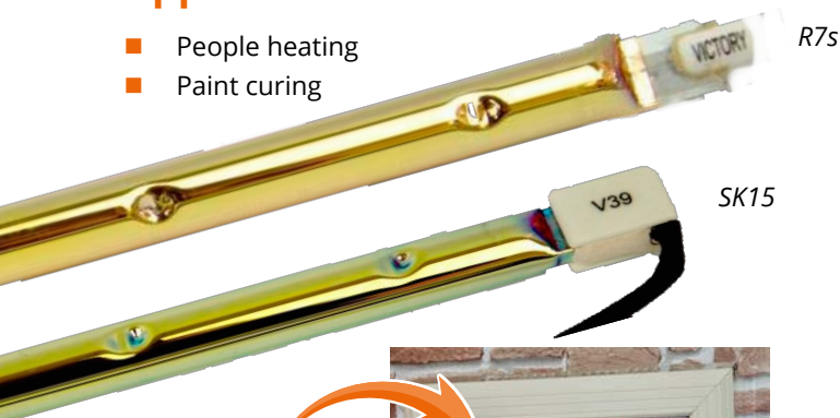
Low Glare Gold lamp