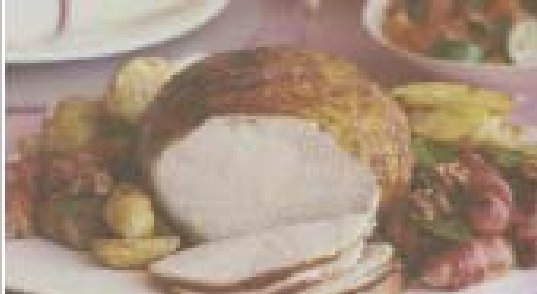
Without Gourmet Heat Lamp